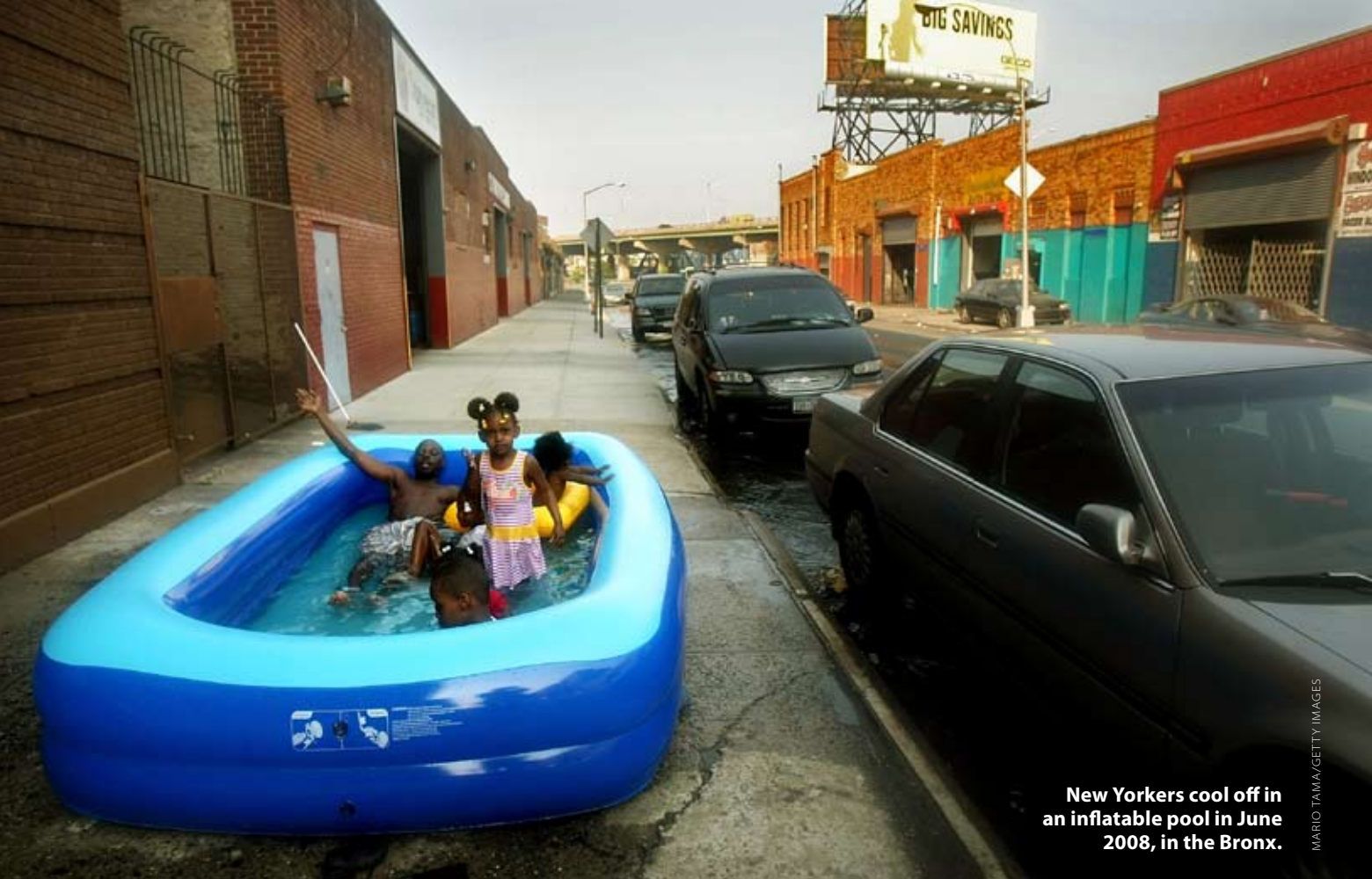
New Yorkers cool off in an inflatable pool in June 2008, in the Bronx.