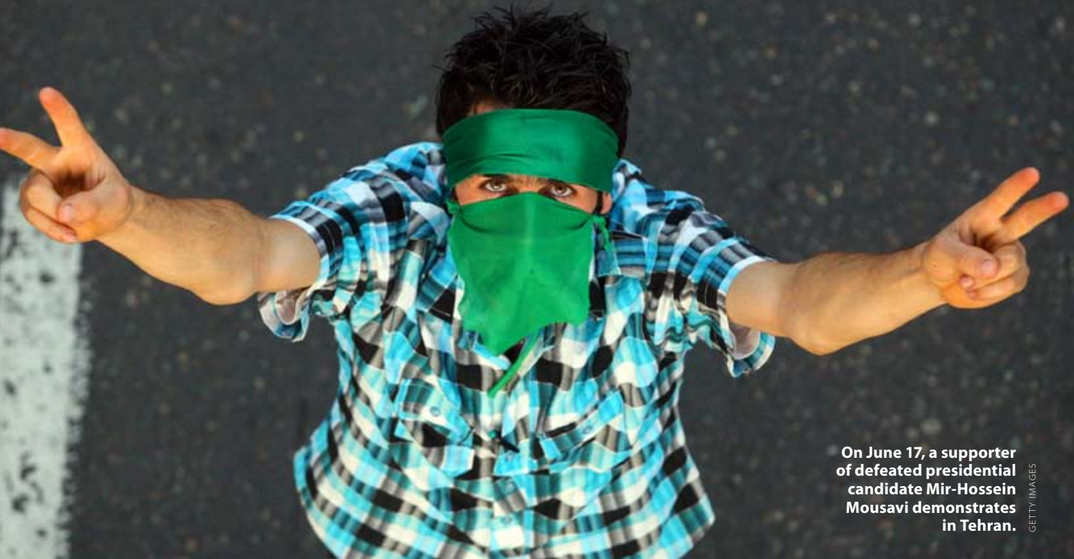
On June 17, a supporter of defeated presidential candidate Mir-Hossein Mousavi demonstrates in Tehran.