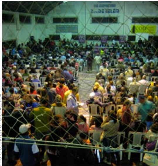
Residents gather in May for the Extreme Southern Regional Participatory Budgeting assembly in Brazil.

Nevertheless, participatory initiatives across the planet continue to look to Porto Alegre. In 2007, Cidade held an international conference on the future of participatory democracy. Some are now calling