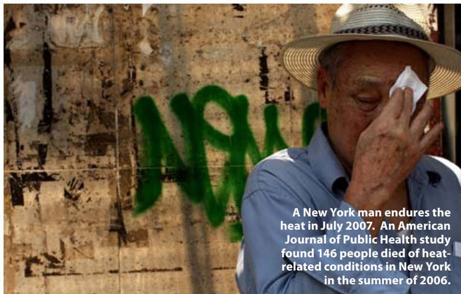
A New York man endures the heat in July 2007. An American Journal of Public Health study found 146 people died of heat-related conditions in New York in the summer of 2006.

Summertime brings a wave of oppressive heat over the South Bronx, scorching a concrete landscape dense with poor, largely black and Latino neighborhoods.