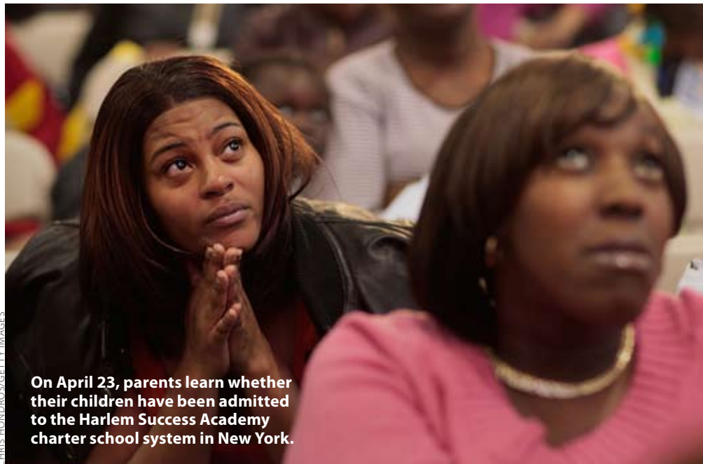
On April 23, parents learn whether their children have been admitted to the Harlem Success Academy charter school system in New York.