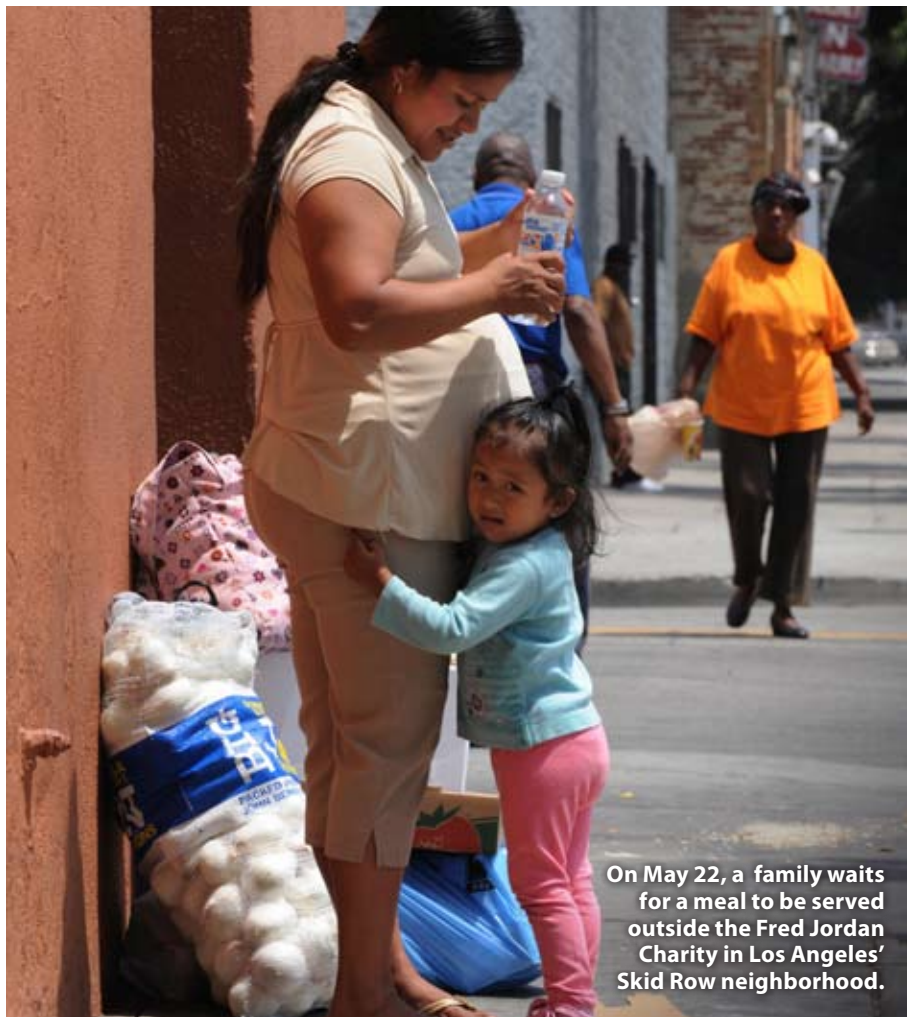
On May 22, a family waits for a meal to be served outside the Fred Jordan Charity in Los Angeles' Skid Row neighborhood.

In 2002, the city of Los Angeles, in alliance with business interests, introduced a redevelopment plan. It called for the elimination of close to 4,000 units of low-income housing in Central City East. Despite the large population of African-Americans in the neighborhood, the real-estate industry marketed downtown "luxury lofts" with ads that displayed affluent white people and the occasional Asian.