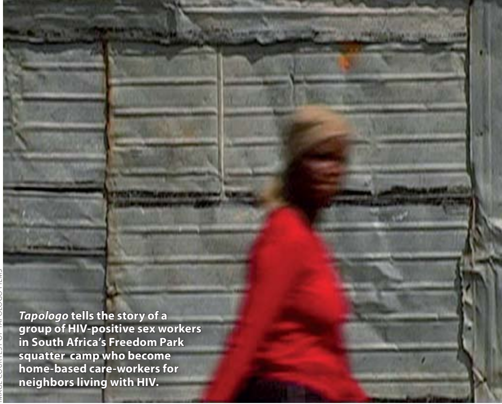
Tapologo tells the story of a group of HIV-positive sex workers in South Africa’s Freedom Park squatter camp who become home-based care-workers for neighbors living with HIV.