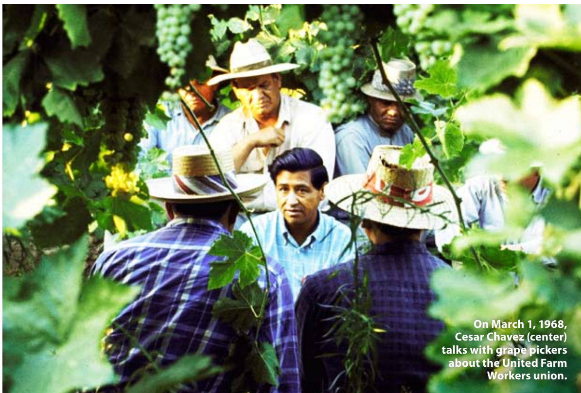
On March 1, 1968, Cesar Chavez (center) talks with grape pickers about the United Farm Workers union.