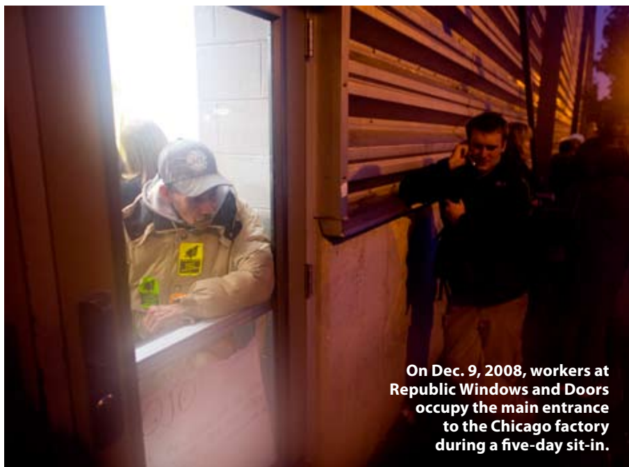
On Dec. 9, 2008, workers at Republic Windows and Doors occupy the main entrance to the Chicago factory during a five-day sit-in.

More than half a year later, that larger movement hasn't materialized. Why not? It's not for lack of reasons. Employers continue to shut down workplaces, cut wages and fight pro-union legislation. Workers in other countries frequently take direct action to fight job losses. French factory workers hold managers hostage. Brazilian and Argentine workers seize and operate